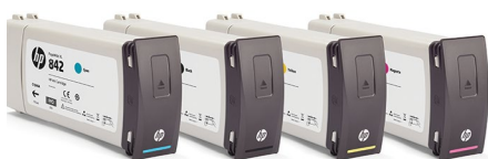
8 (2 x 775-ml per color with auto-switch)

The HP PageWide XL 8000 Printer includes a stationary 101.6 cm (40 inches) printbar that spans the whole printing width. As paper moves under the printbar, the entire page is printed in one pass, enabling very high printing speeds.