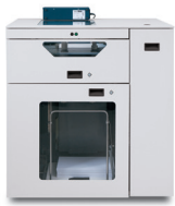
C.P. Bourg BSFx Dual-Mode Sheet Feeder