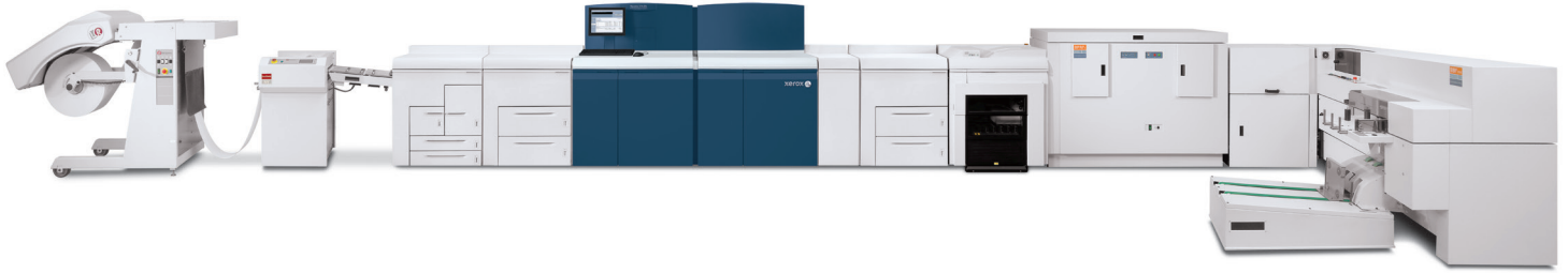
Xerox® Nuvera® 314 EA Perfecting Production System with Lasermax Roll Systems SheetFeeder NV-R, Xerox® Production Stacker and Xerox® Book Factory