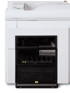
Xerox® Production Stacker