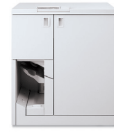
Xerox® Tape Binder