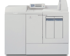
Xerox® DB120-D Document Binder