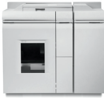
Basic Finisher Module Plus