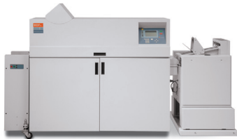
C.P. Bourg BDFNx Booklet Maker with Square Edge