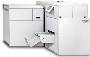
Watkiss PowerSquare 200