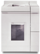
Basic Finisher Module