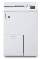
GBC eBinder II