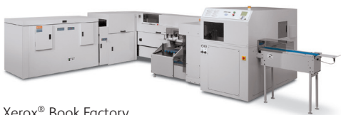
Xerox® Book Factory