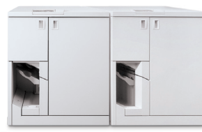
Dual Xerox® Tape Binders