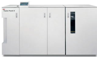
GBC Fusion Punch II with Offset Stacker