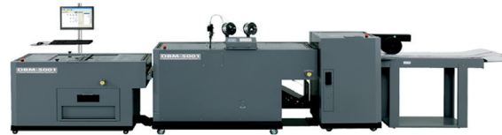
Duplo DBM-5001 Inline Booklet Maker