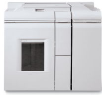
Basic Finisher Module – Direct Connect